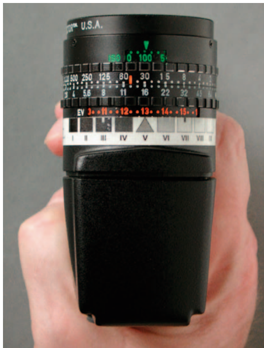
fig.1 The customized zone dial for the Pentax Digital Spotmeter is a visual reference and will simplify zone placement. Zone III and VII are marked to place shadow and highlight details.